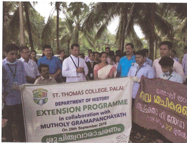
Figure 1: Inauguration of cleaning campaign at Mutholy Grama Panchayat, Sept.29, 2018

gathered at Mutholy Panchayat office, where they were given refreshments by the Panchayat and hence the program successfully came to an end. As a token of appreciation, Mutholy Grama Panchayat awarded the history association with a memento; through this they congratulated all the students and teachers for their active participation in this campaign. This program also helped to create awareness among the students and the public about the importance of cleanliness.