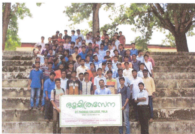
Figure 3: World Environment Day-5 th June 2018

Members of Bhoomitra Sena Club of St. Thomas College, Palai celebrated World Environment day on 5 th June 2018. It focuses to upkeep the campus and nearby places in clean and green and thus initiate a campaign for green and clean philosophy. The volunteers and co-ordinator along with faculty members from various departments took the oath to preserve the environment.