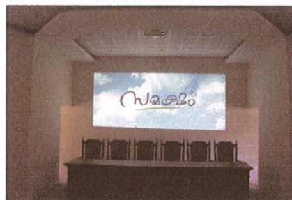
Figure.10: Samksham movie campus release on 22 January 2019