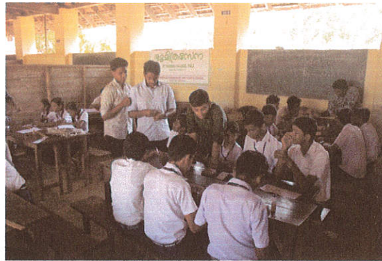
Figure.9: Training camp by BMS volunteers at School

AFFILIATED TO MAHATMA GANDHI UNIVERSITY, KOTTAYAM, KERALA