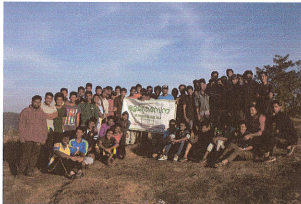
Figure8. BMS Volunteers at Kattadippara, Idukki District