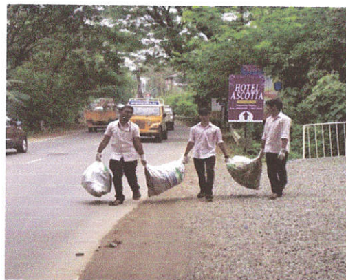
Figure 2: Students transferring collected solid wastes to vehicles, Sept. 29, 2018