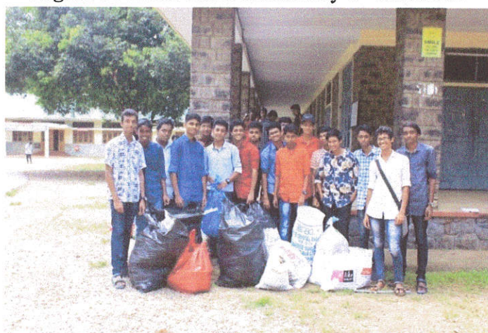
Figure.4: World Environment Day-5 th June 2018