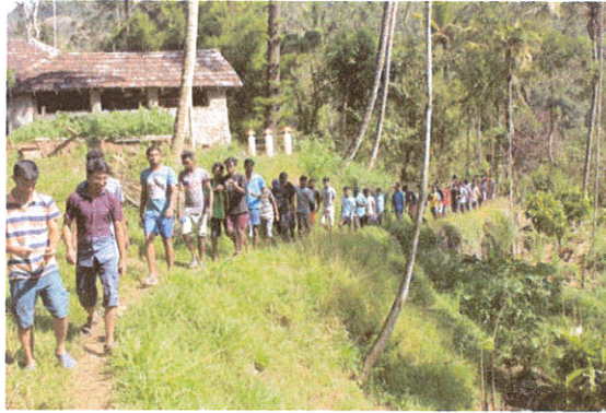
Figure7. Trekking to Kattadippara, Idukki District

AFFILIATED TO MAHATMA GANDHI UNIVERSITY, KOTTAYAM, KERALA