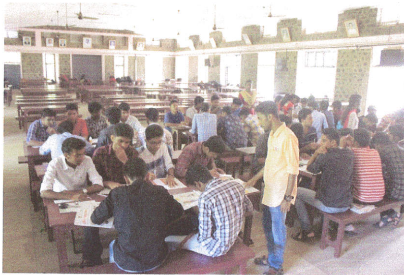
Figure.5: Training camp for making paper bag, pen and file held on 25 th Nov. 2018

A training camp of making paper bag, pen and file was organized for BMS member on 25 th November 2018. BMS unit of the college invited trained students from St. Stephan's College, Uzhavur, Kottayam to conduct the classes. It was organized for the students to promote and encourage the use of paper made materials and to reduce the use of plastic made materials in the campus. The training camp also aims to develop our own trained volunteers who can teach the method of making paper pen, bag and file to other students within the campus and outside the campus.