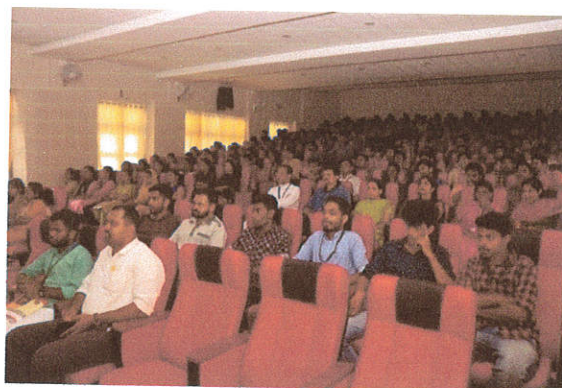
Figure. 11: BMS members watching the movie Samksham on 22 January 2019

AFFILIATED TO MAHATMA GANDHI UNIVERSITY, KOTTAYAM, KERALA